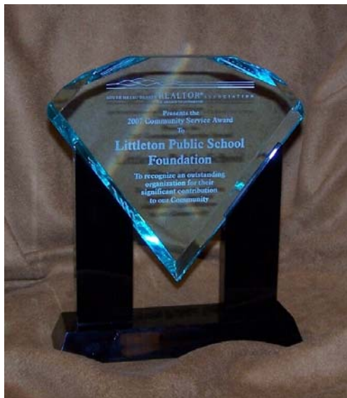
South Metro Denver Realtor Association 2007 Community Service Award

This has made it possible for the Foundation, in 2006-2007, to provide nearly $154,000 in funding to the LPS teacher/student community.